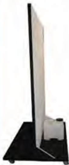
Double-sided flats on wheels

Merrin Diack, Rolleston College, January 2017