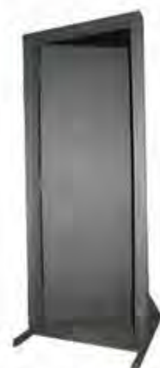
Free standing doors